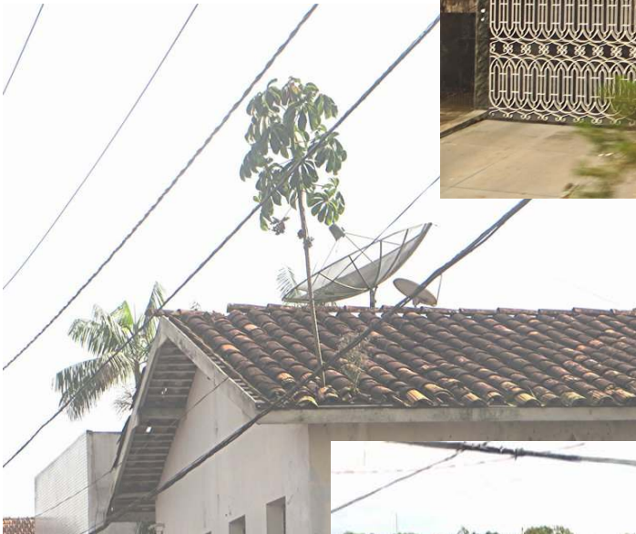
This hearty tree growing out of a tile roof, as shown on the left, seemed to be doing quite well in its unlikely location.